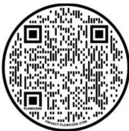
Fortune 500 Article Scan or Click