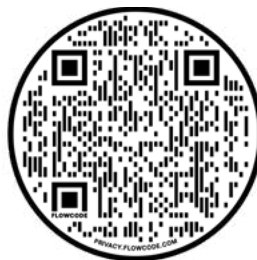
W. R. Berkley Financial Scan or Click