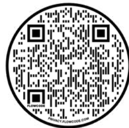
Berkley Locator Scan or Click