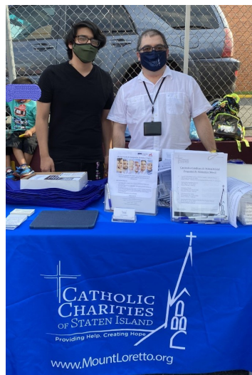
Catholic Charities of Staten Island and Manhattan participated in the Mexico Independence day Celebration organized by the Parish of Mount Carmel Parish, September

Meeting ID: 635 075 8090 Passcode: 359050