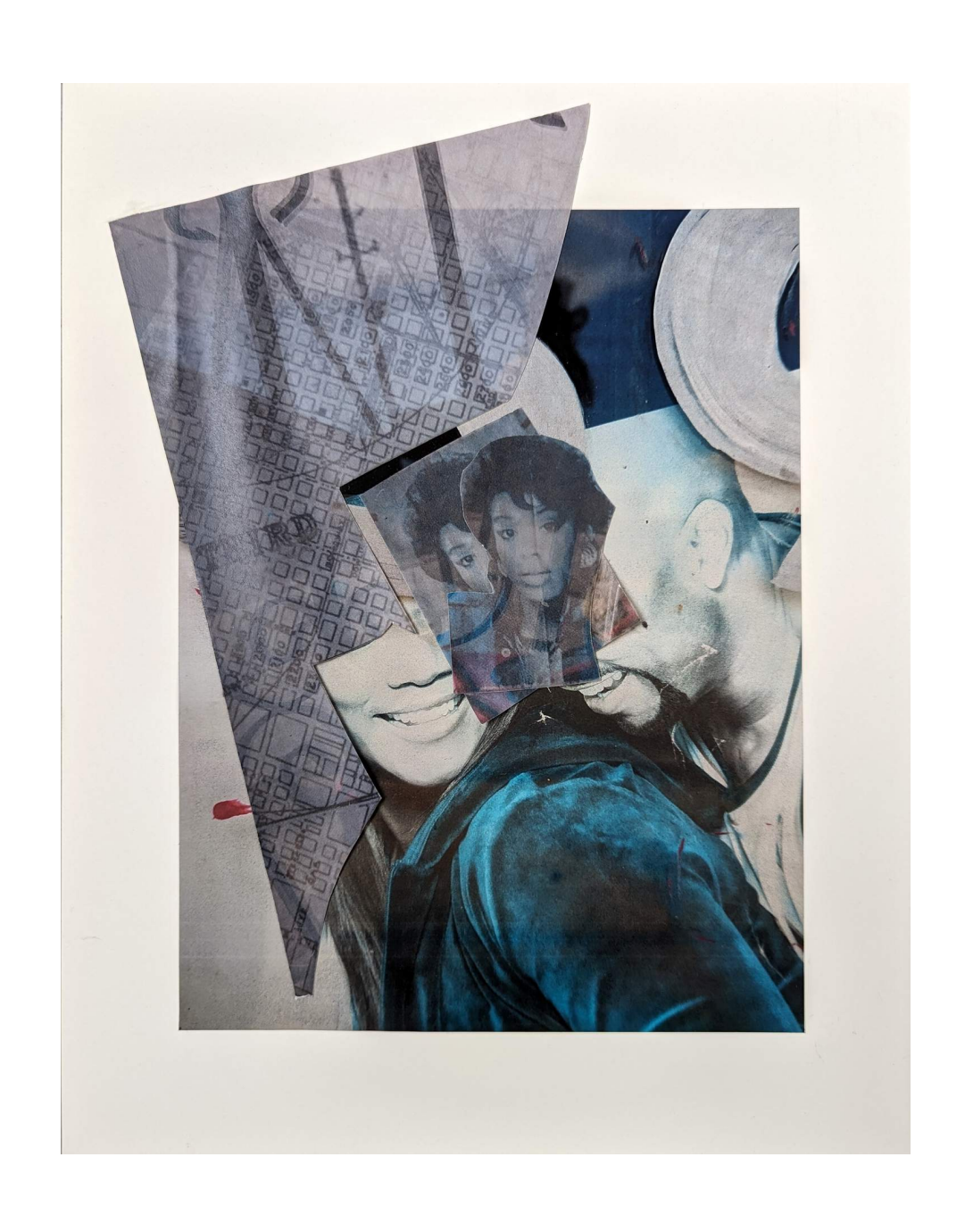
Regina Agu Trader's Compass, 2018 Collage on board 14 x 11 in. RA0003