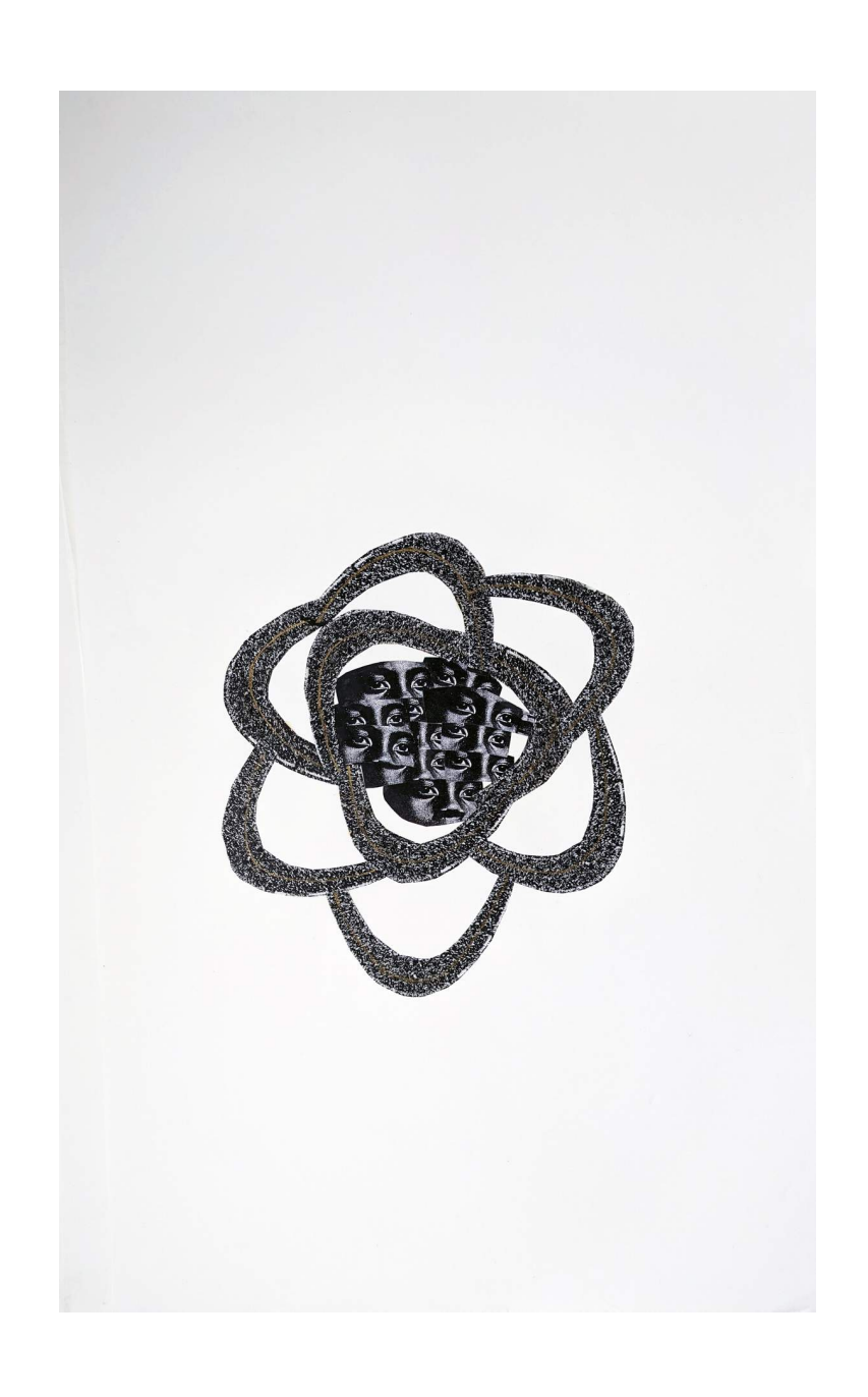
Regina Agu Flora Exotica, 2023 Collage on paper 50 x 28 in. RA0002