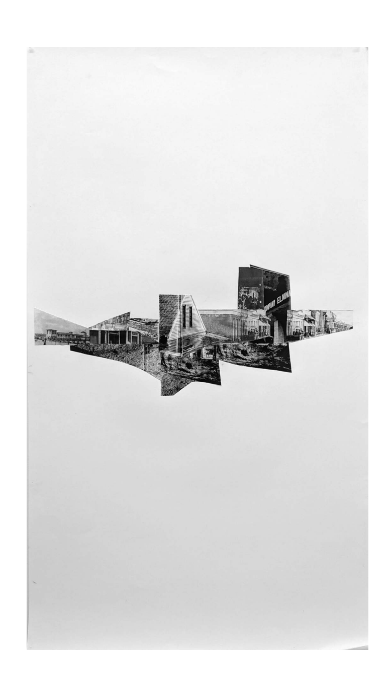
Regina Agu Relic 02, 2023 Collage on paper 50 x 28 in. RA0001