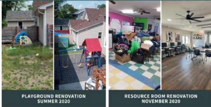
PLAYGROUND RENOVATION SUMMER 2020