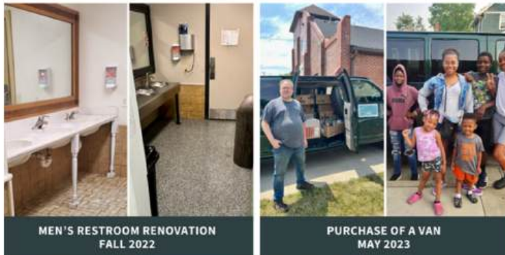
MEN'S RESTROOM RENOVATION FALL 2022