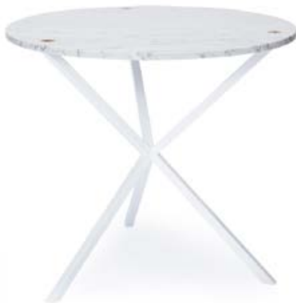
NEB Round Dining Table