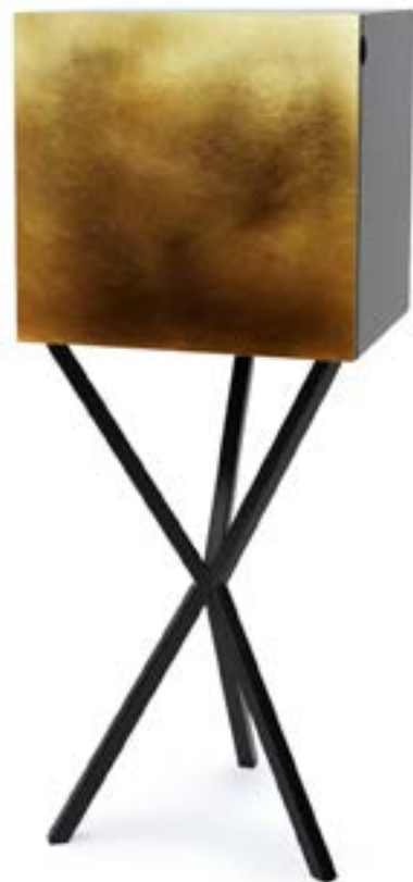
NEB Bar Unit