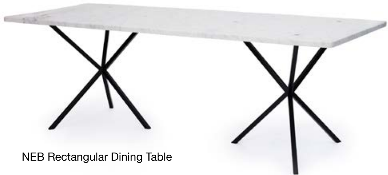
NEB Rectangular Dining Table