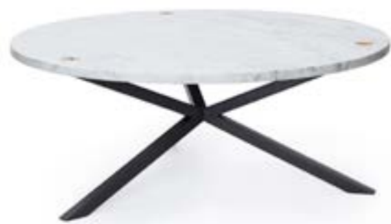
NEB Round Coffee Table