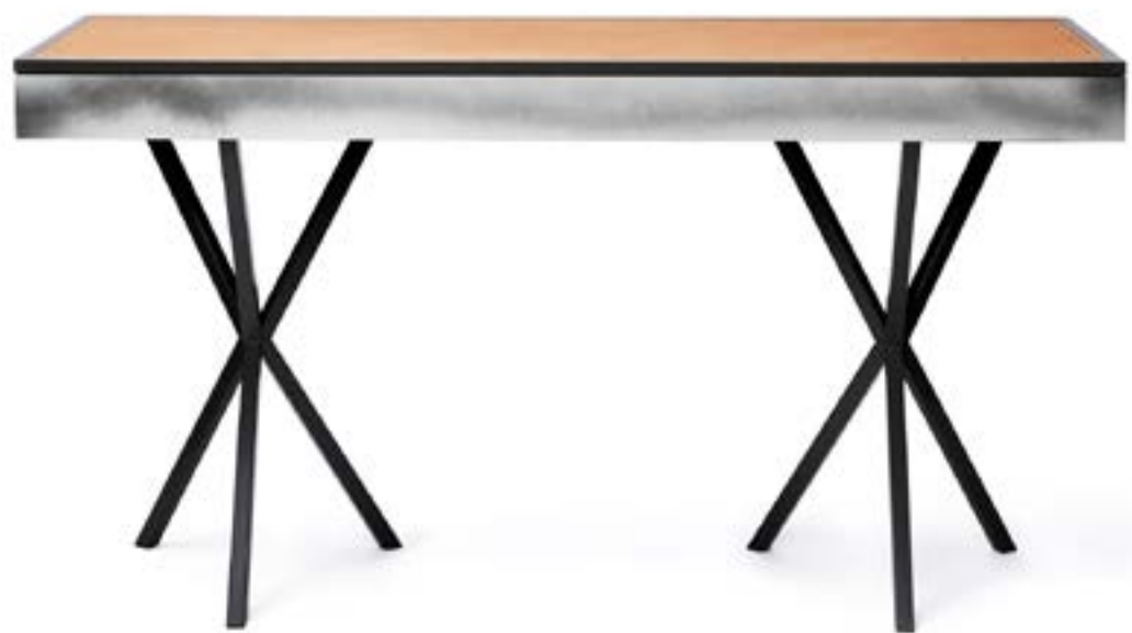
NEB Writing Desk