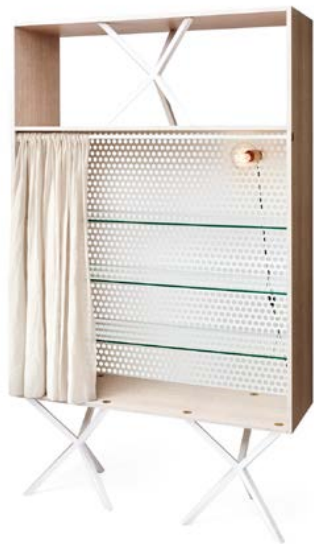
NEB Cabinet La Pasticceria