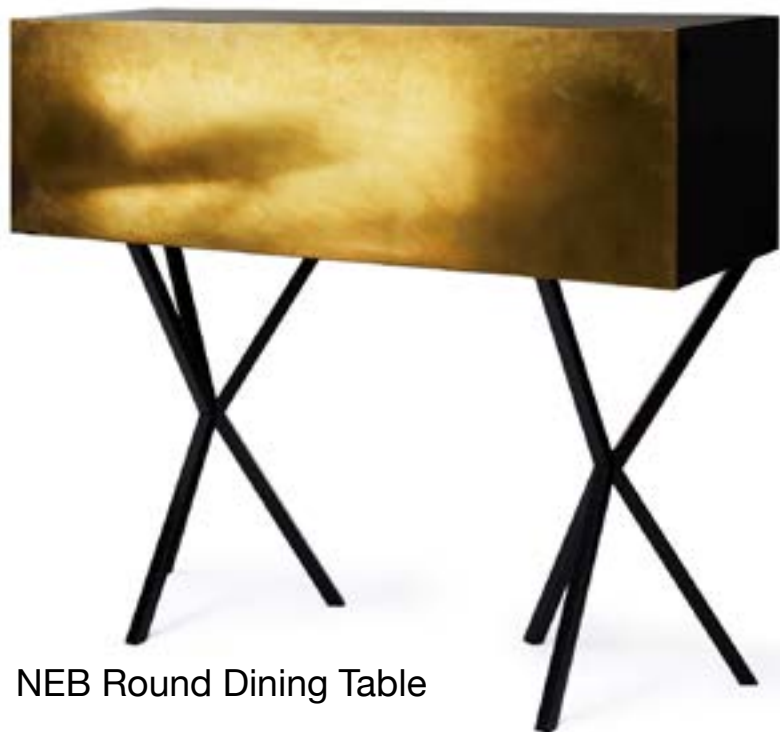
NEB Round Dining Table