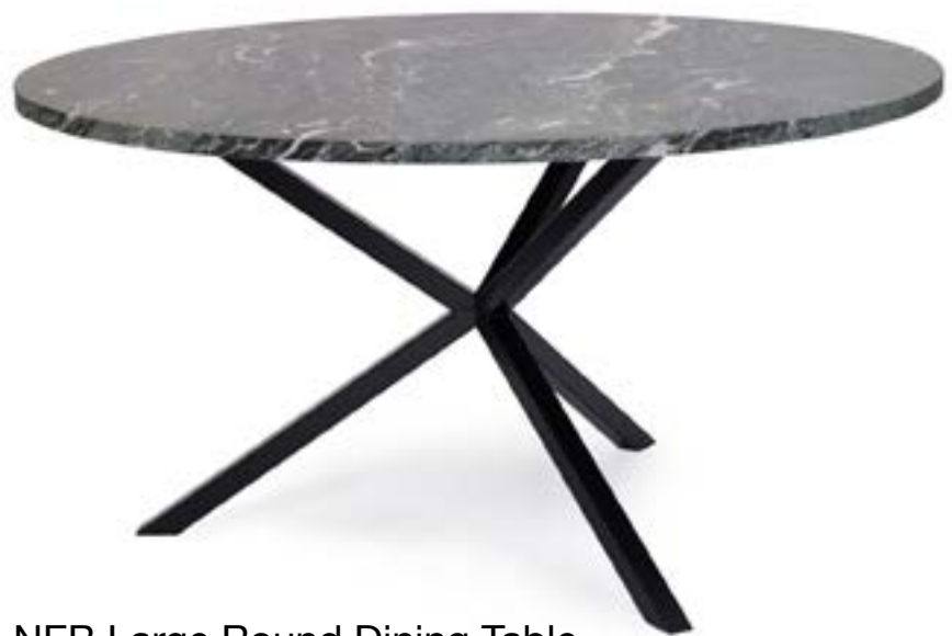
NEB Large Round Dining Table