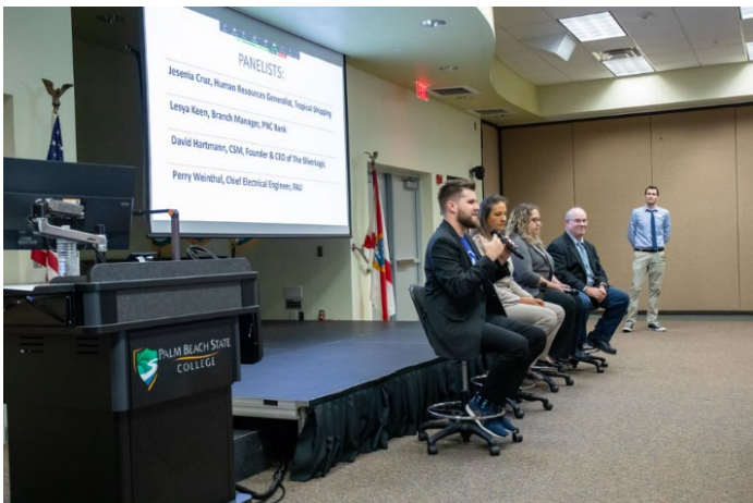
Figure 4. Fall 2023 STEM Career Panel for Engineering at Boca Raton Campus

This April the SATC program will be hosting a series of Career Panels featuring professionals from across the STEM fields. Topics will range from career experience insights to advice for students planning their own pathway into the field. STEM disciplines represented this term will include Mathematics, Computer Science, and Engineering. We are excited to share our Mathematics panel will be partnered with Math Awareness Week at PBSC during the first week of April! Please check