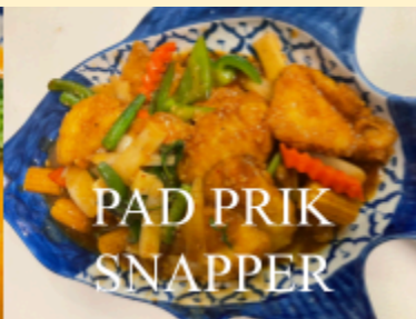
PAD PRIK SNAPPER