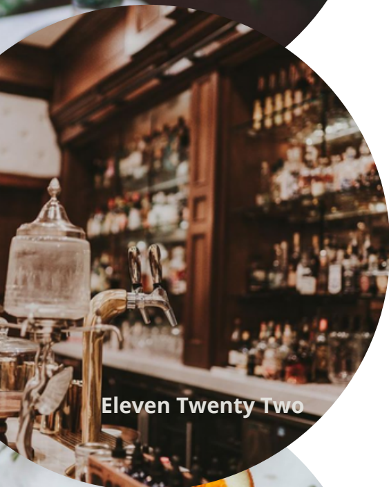
Eleven Twenty Two