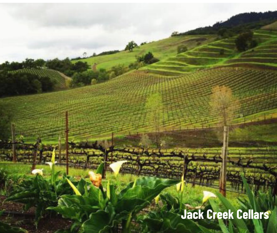
Jack Creek Cellars