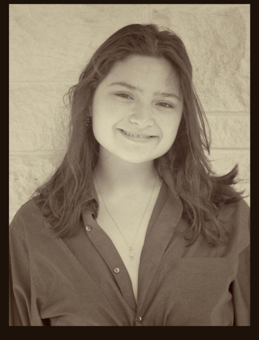
"Most likely to know everyone's astrology chart"