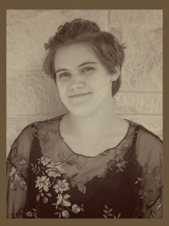
"Most likely to fall for a pyramid scheme"