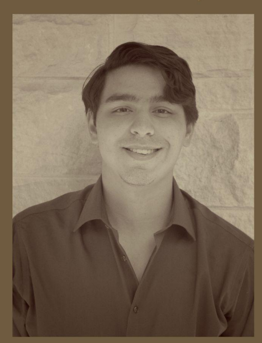
"Least likely to be part of a gay throuple"