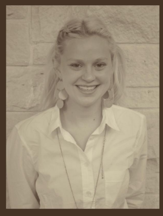
"Most likely to be the bearer of bad news"