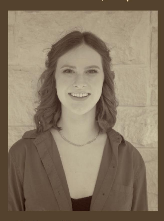
"Most likely to move out of the country"