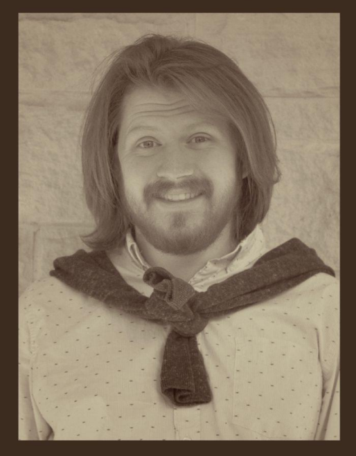
"Most likely to be part of a gay throuple"