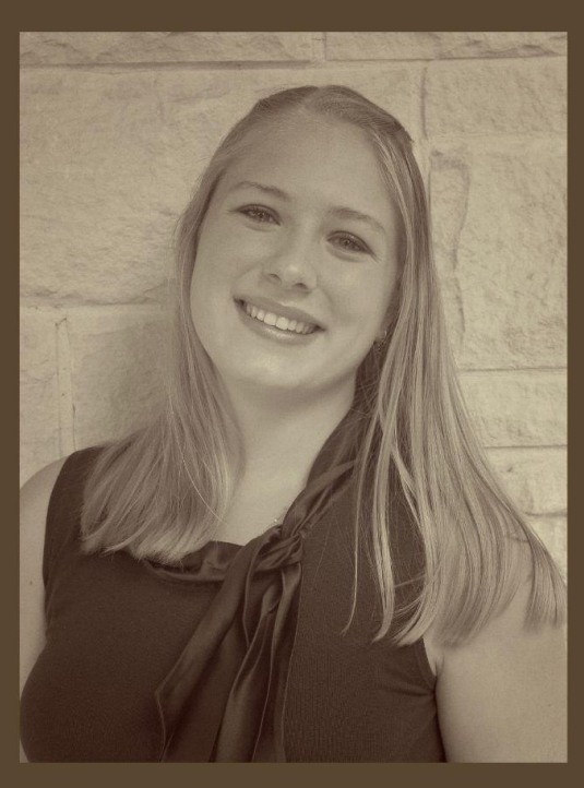
"Most likely to drop their phone in the toilet"