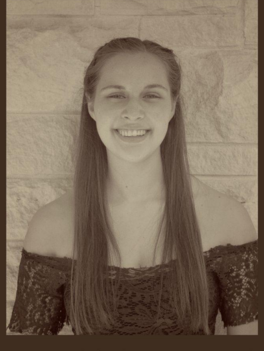
"Most likely to succeed"