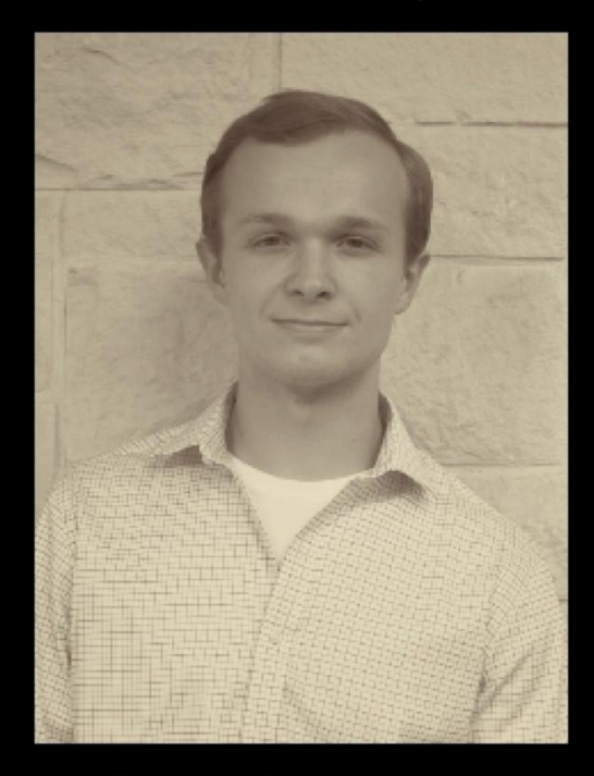
"Most likely to be ambivalent at the prospect of joining a gay throuple"