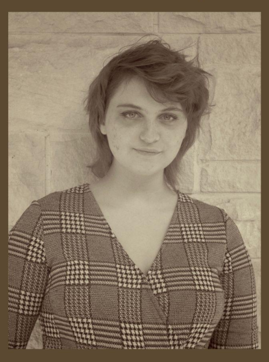
"Most likely to survive the hunger games"