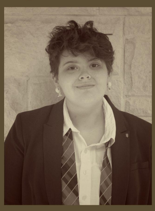
"Most likely to join a cult"