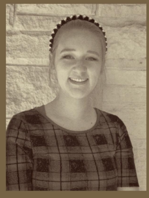
"Most likely to die first in a horror movie"